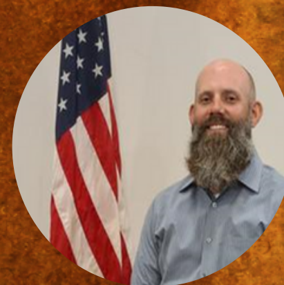
Mayor of Sorrento Christopher Guidry